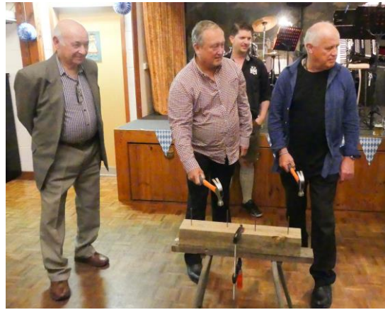
Competition at Oktoberfest