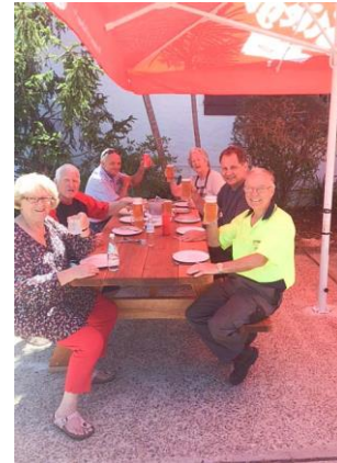
Enjoying the new outdoor furniture