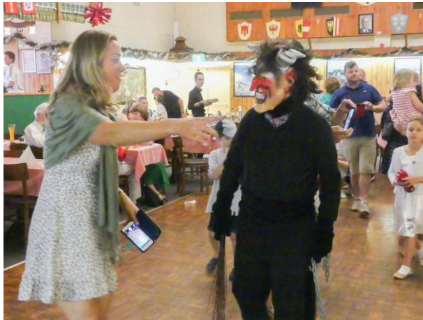
Krampus gets his instructions