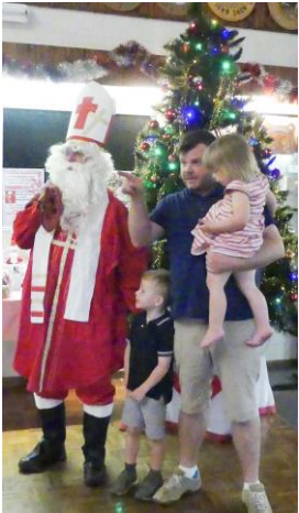
Saint Nik visits the club