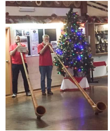
Alpenhorn with the Swiss Yodellers