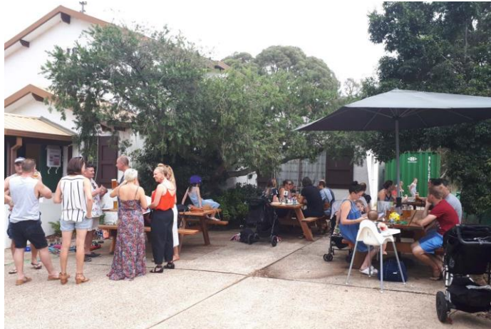
Sunday afternoon in the Beer Garden