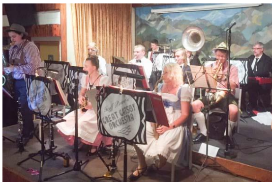
Great Gatsby Orchestra