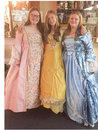
Belles of the ball