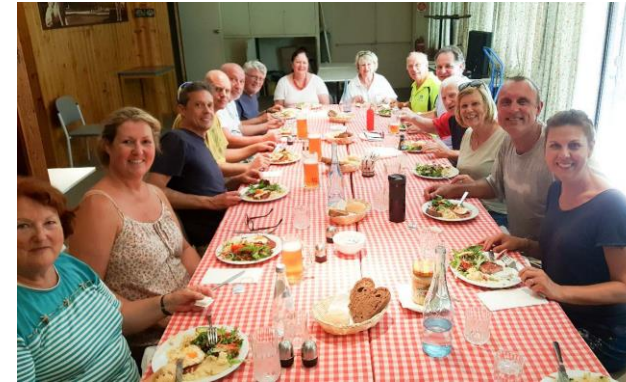
Working bee lunch