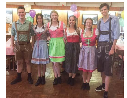
Wait staff looking good