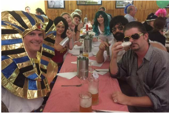
King Tut and friends at Fasching