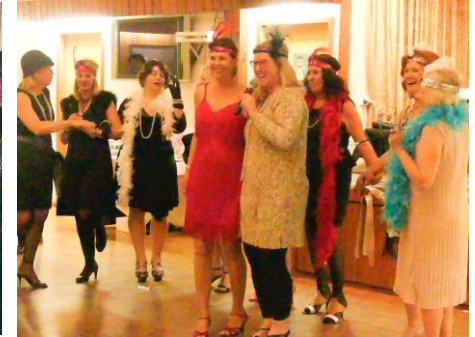
Roaring 20's night