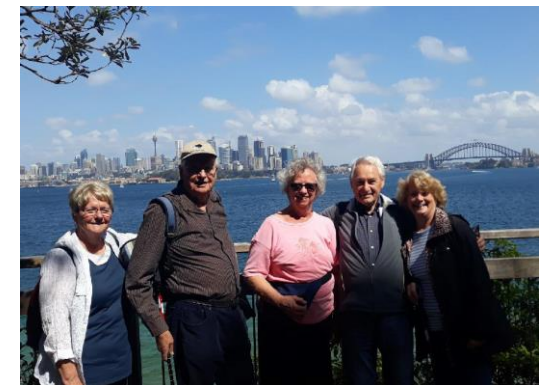
Walkers on a harbour walk