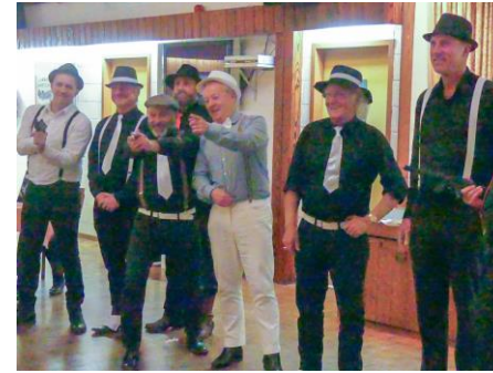
Roaring 20's night