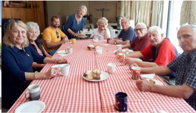
Working bee participants enjoy morning tea