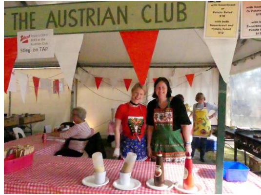
Volunteers at Eurofest