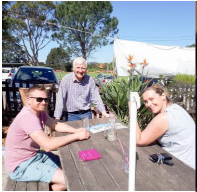
Enjoying the sun at the Austrian Club