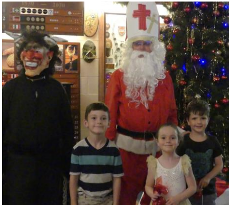
Kids with Krampus & St Nikolaus