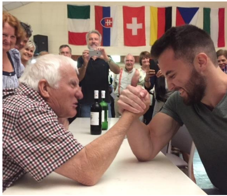
Serious competition at Oktoberfest