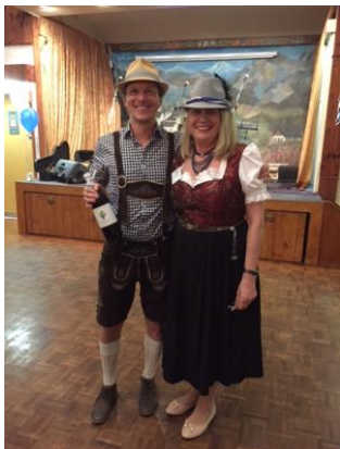
Best dressed man at Oktoberfest