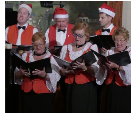
Concordia Choir at Krampus