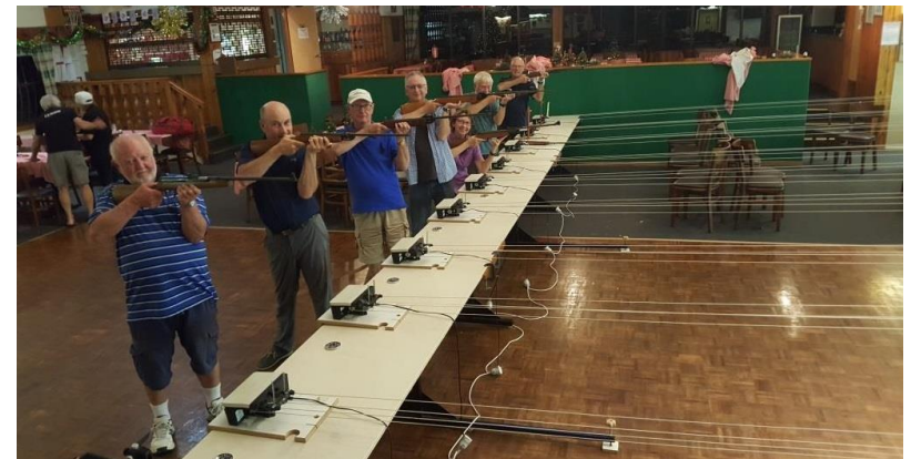
December Fun Shoot