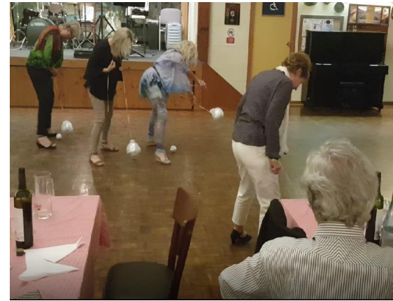
Ladies game at the Soccer Ball