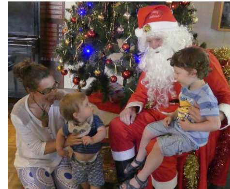
Children's Christmas Party