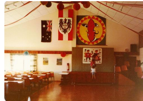
Old interior of the Austrian Club