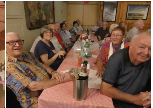
Swiss group at Die Laterndl