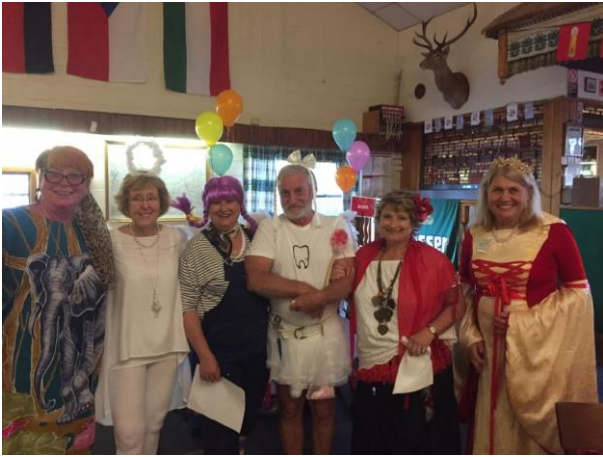
Serious Faschingsfest fun