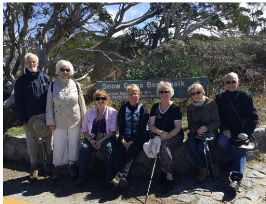
Bushwalkers at Thredbo