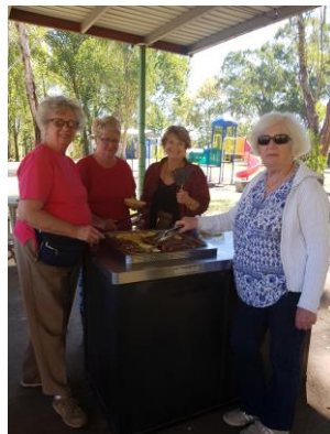
OTH ladies BBQ near Khancoban