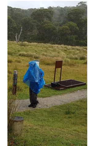
Walking in the rain at Thredbo