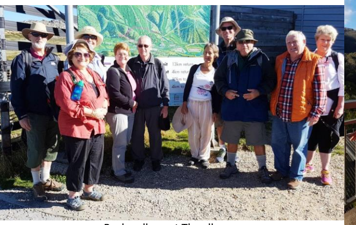
Bushwalkers at Thredbo