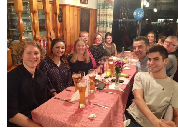
Guests at the Tirolean night