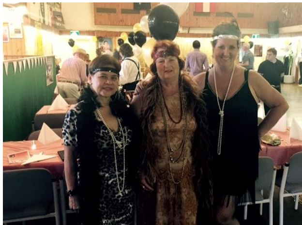
Great Gatsby glamour