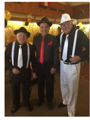
Great Gatsby gangsters