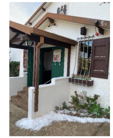
A little snow at Christmas in July