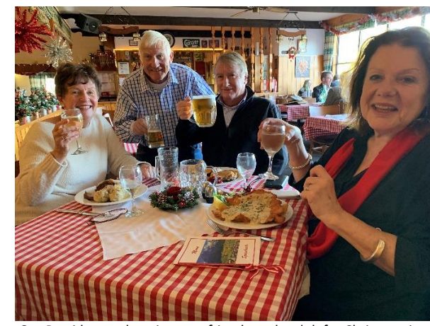
Our President welcoming new friends to the club for Christmas in