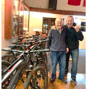
Mountain bikers have a big thirst and appetite after their night ride