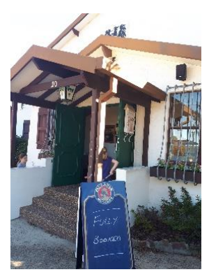
Mothers Day - another sell-out event, don't forget to book