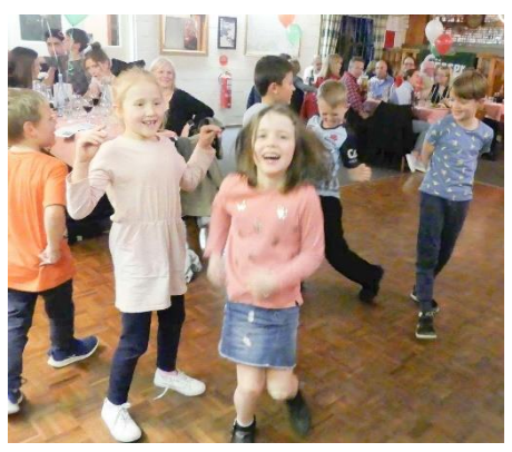
Chicken dance Italian Night