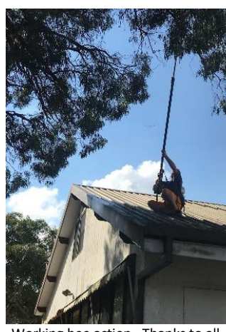
Working bee action. Thanks to all volunteers