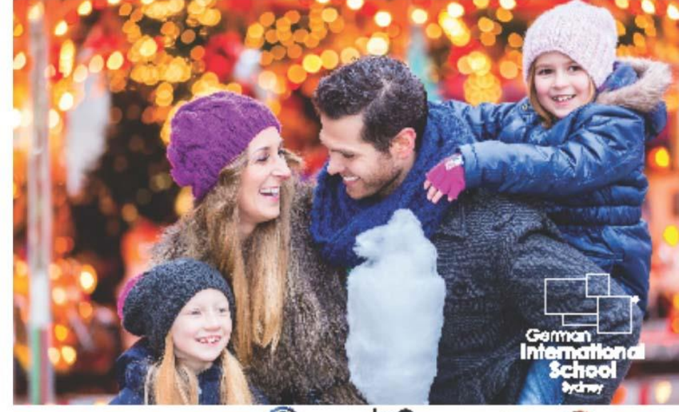
Proudly sponsored by