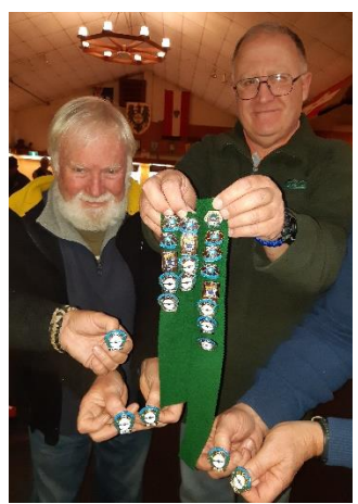
Shooters show off their medal haul