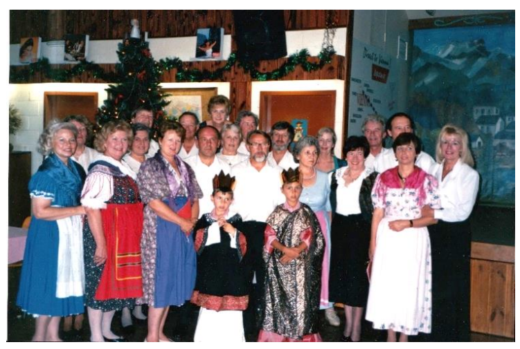
The Austrian Club choir in 1995