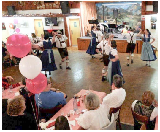
St. Raphael's show us how it's done