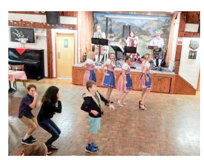
Kids join in the fun