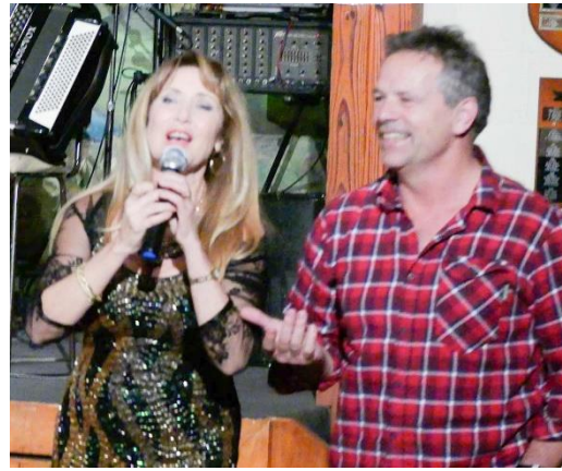
Mercedes with the birthday boy