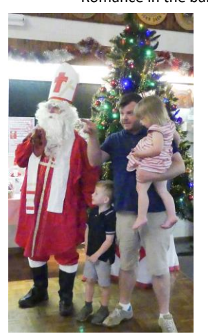
Saint Nik visits the club