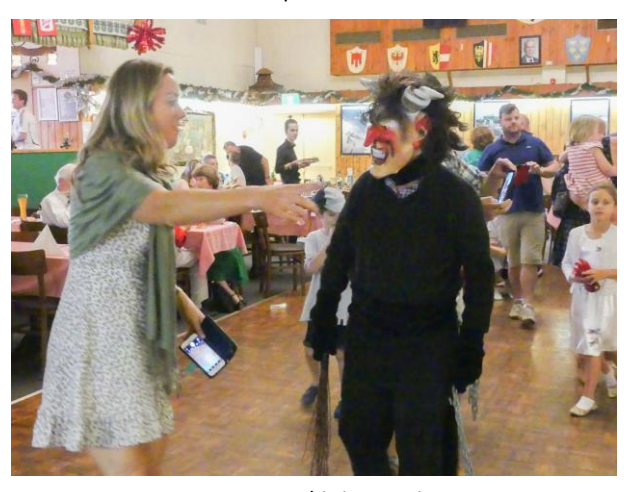
Krampus gets his instructions