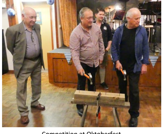
Competition at Oktoberfest