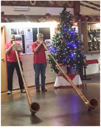
Alpenhorn with the Swiss Yodellers