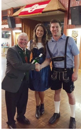
Best dressed couple at the Steirerabend