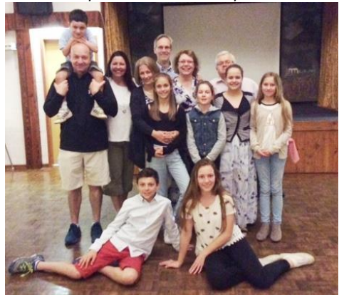
Austrian, German and Swiss friends enjoying lunch