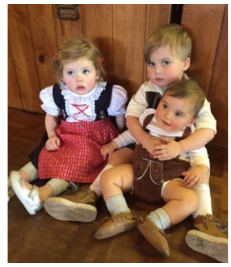
The next generation of Austrian Club members