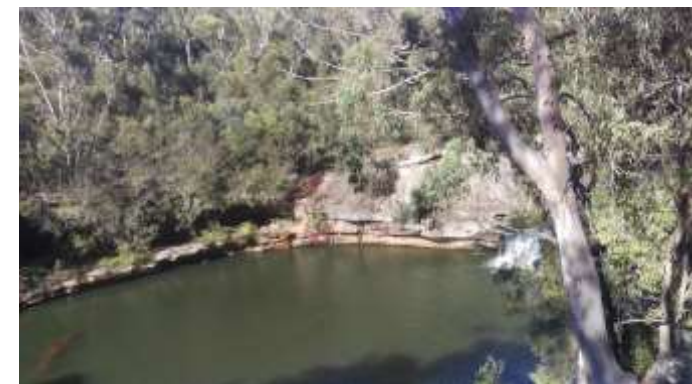
Minerva Pool- visited by the walking group