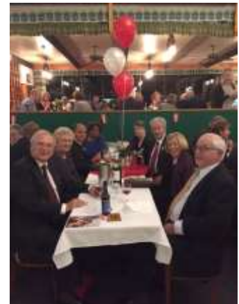
Invited guests at the Annual Ball