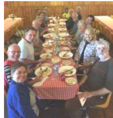
Lunch at the April working bee