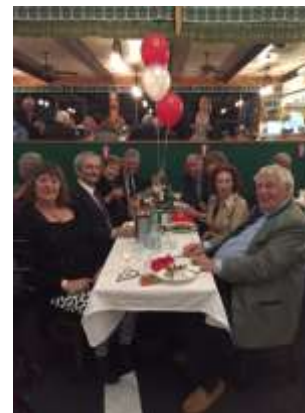
More Annual Ball guests