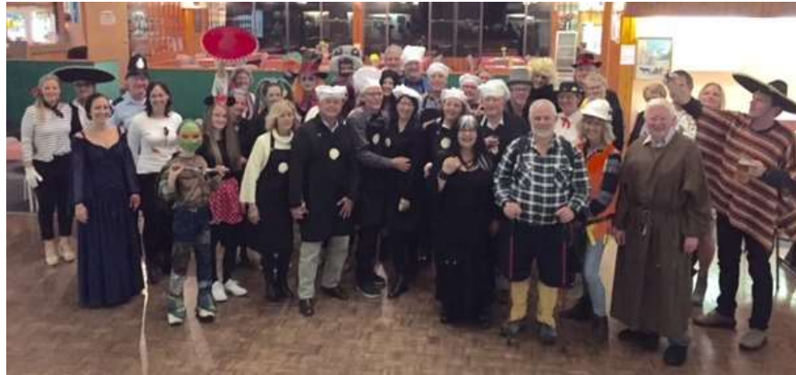
Fancy dress birthday party at the club with the theme "M"