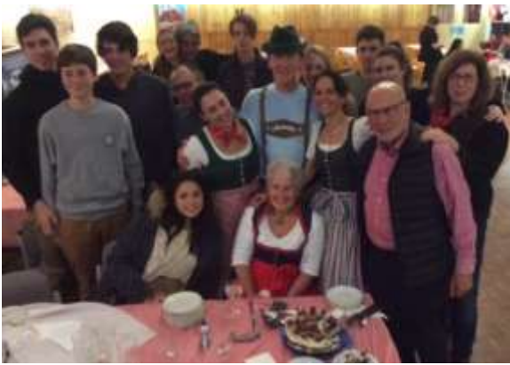
90 th Birthday at the club