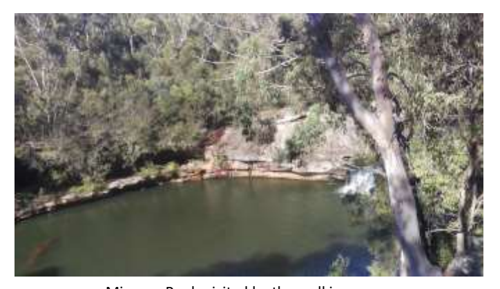
Minerva Pool- visited by the walking group