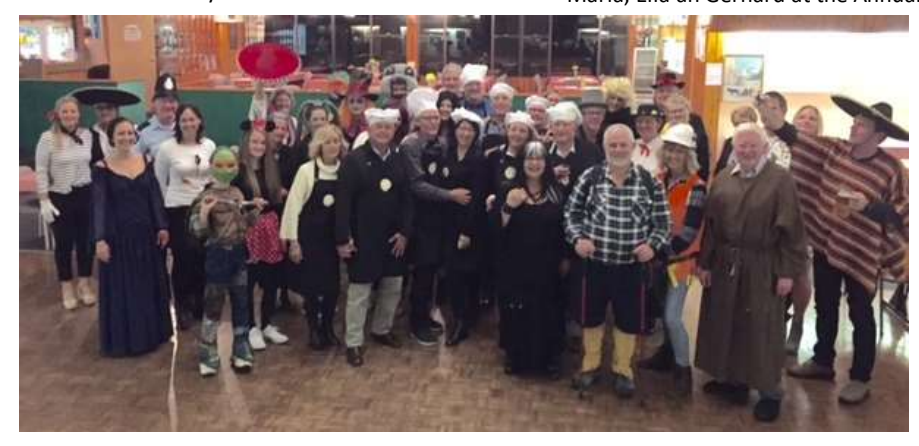
Fancy dress birthday party at the club with the theme "M"