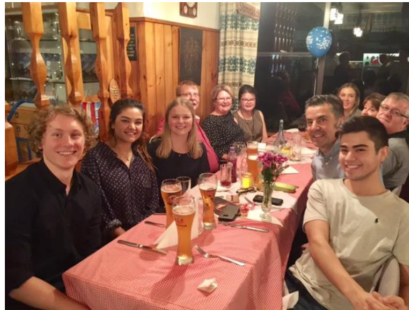
Guests at the Tirolean night