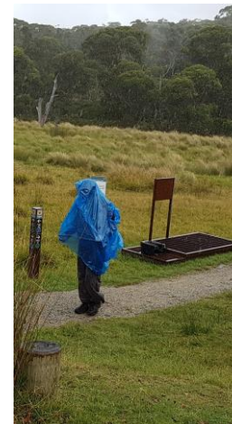
Walking in the rain at Thredbo

or bookings online at bookings@austrianclubsydney.com.au