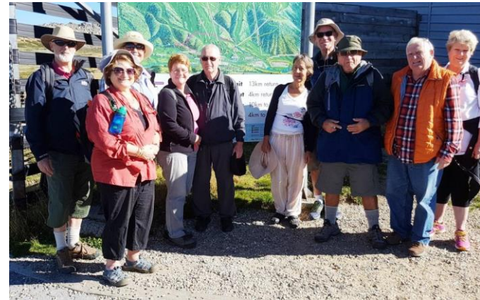
Bushwalkers at Thredbo