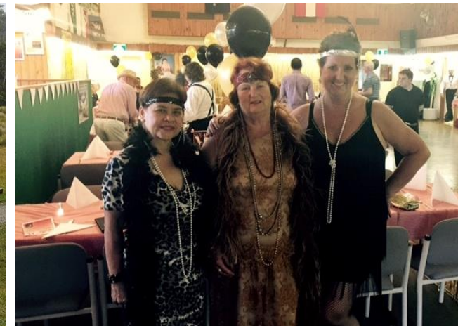
Great Gatsby glamour