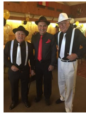
Great Gatsby gangsters